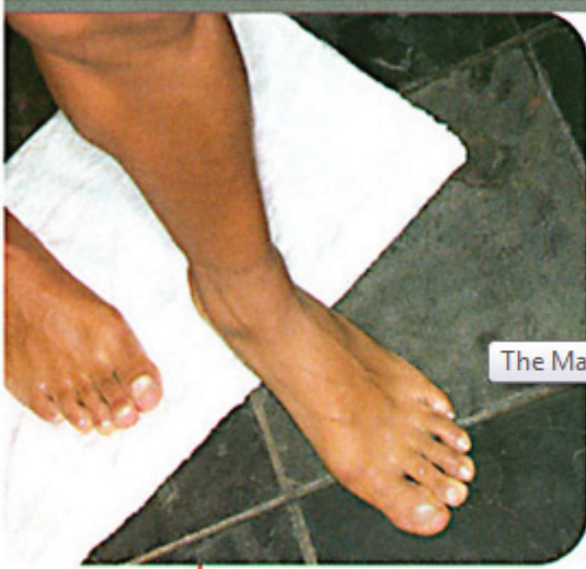
The Male Room (page 3)

Even if you have heated floors, be sure to keep bathmats around to prevent tracking water.